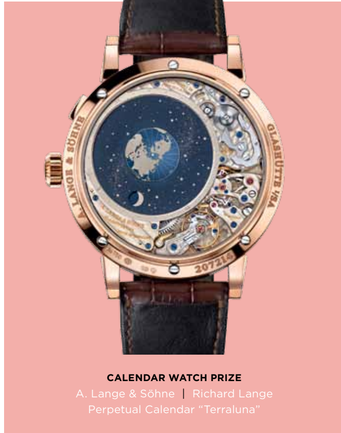
CALENDAR WATCH PRIZE A. Lange & Söhne | Richard Lange Perpetual Calendar "Terraluna"