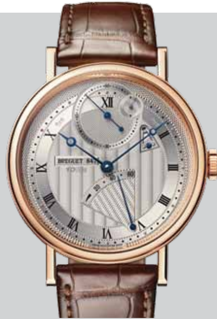
'AIGUILLE D'OR' GRAND PRIZE Breguet | Classique Chronométrie