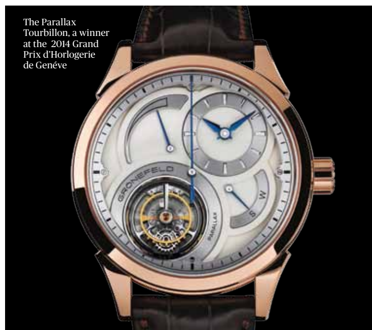
The Parallax Tourbillon, a winner at the 2014 Grand Prix d'Horlogerie de Genève