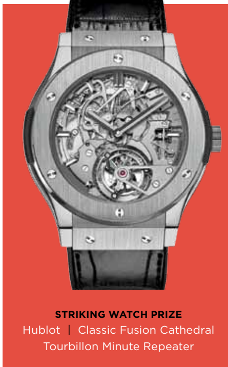
STRIKING WATCH PRIZE Hublot | Classic Fusion Cathedral Tourbillon Minute Repeater