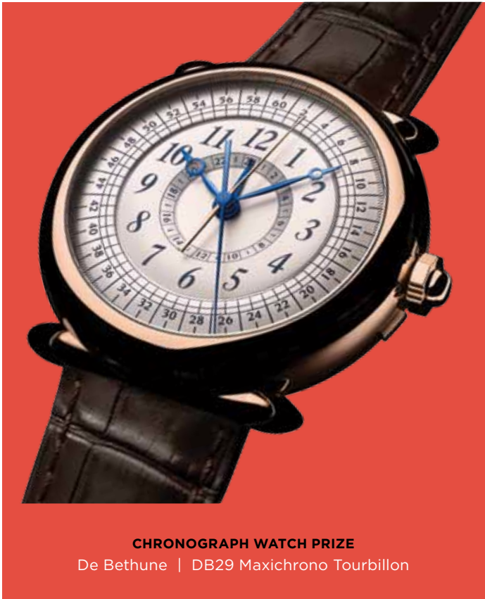
CHRONOGRAPH WATCH PRIZE De Bethune | DB29 Maxichrono Tourbillon