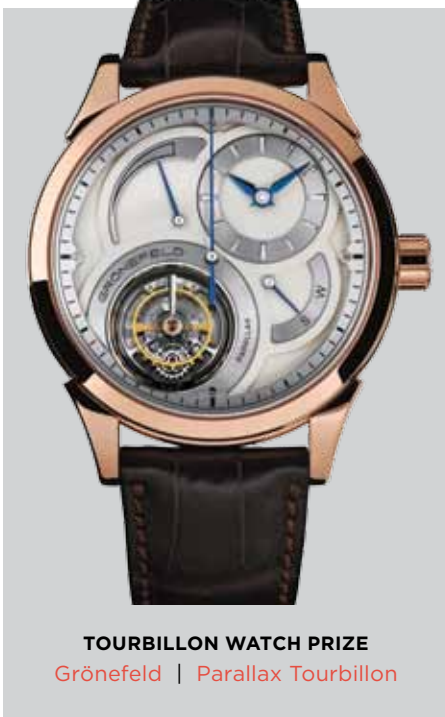
TOURBILLON WATCH PRIZE Grönefeld | Parallax Tourbillon