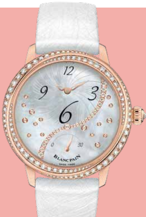
LADIES' WATCH PRIZE Blancpain | Women Off-centered Hour