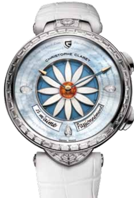
LADIES' COMPLICATIONS WATCH PRIZE Christophe Claret | Margot