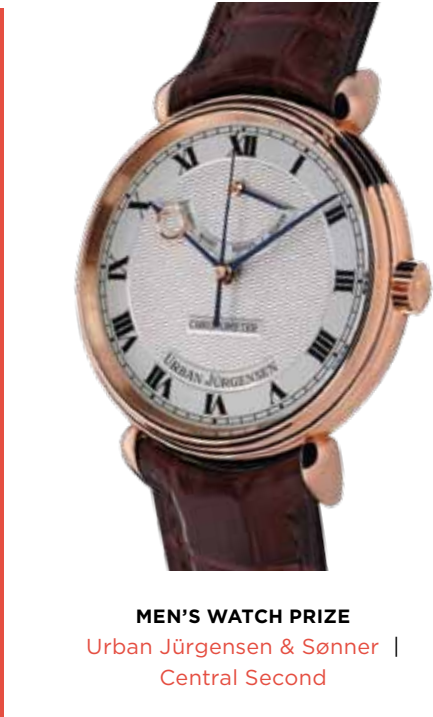
MEN'S WATCH PRIZE Urban Jürgensen & Sønner | Central Second